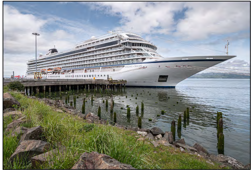
Dave Patzwald Viking Orion Docked on Columbia River