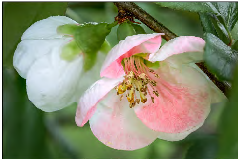
Chris Currie Front and Back