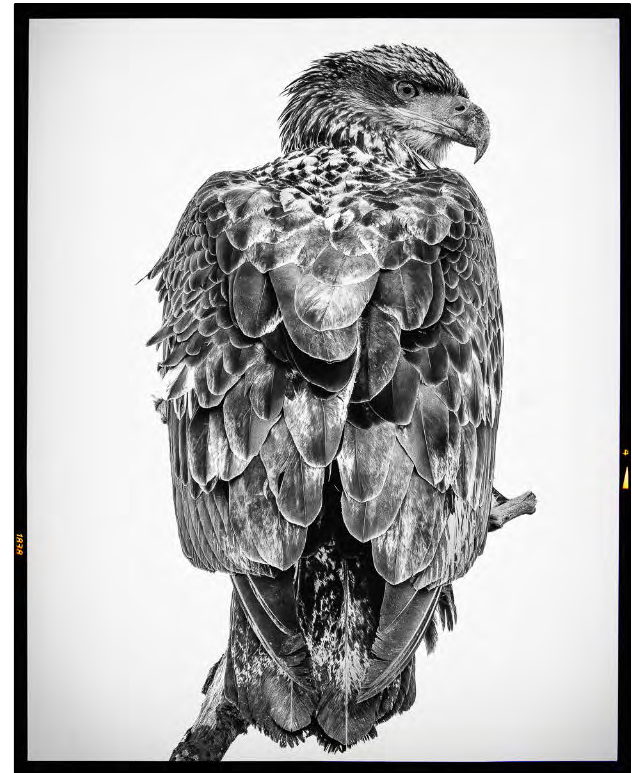
Glen Moffitt Young Eagle in Black and White