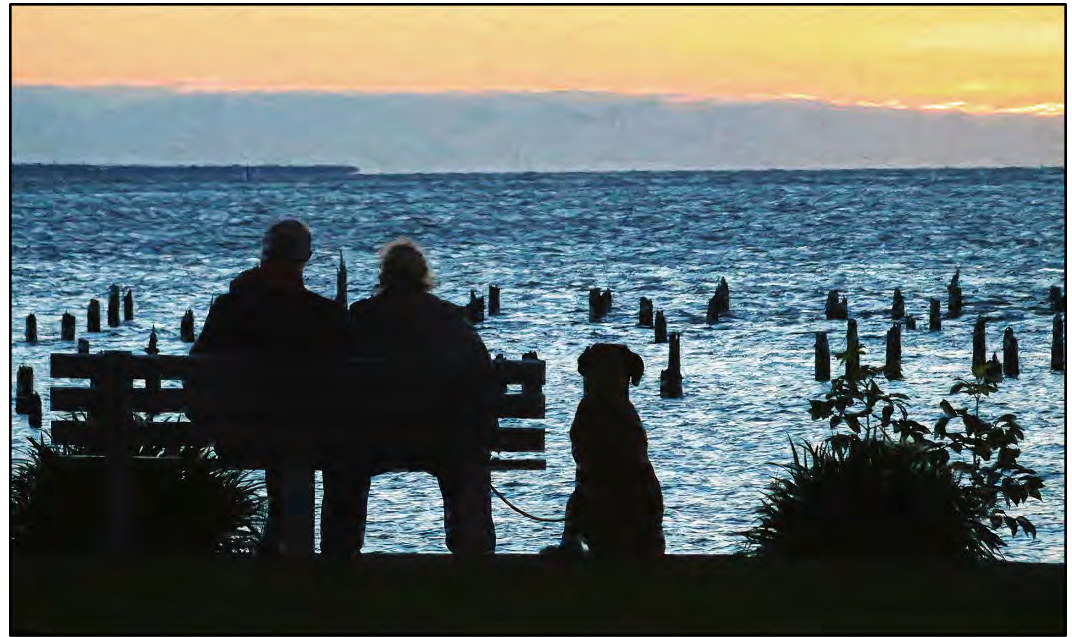
Mercedes Perez (clockwise from upper left) View Through Dilapidated Windows Companionship Pudding Creek Calm Water Reflections