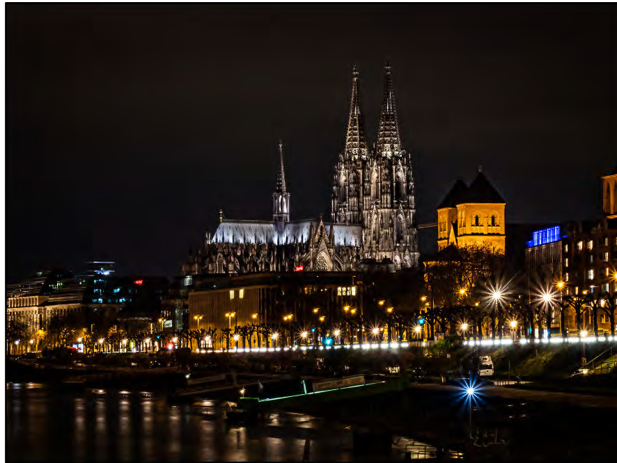
Lauren Heerschap (clockwise from upper left)