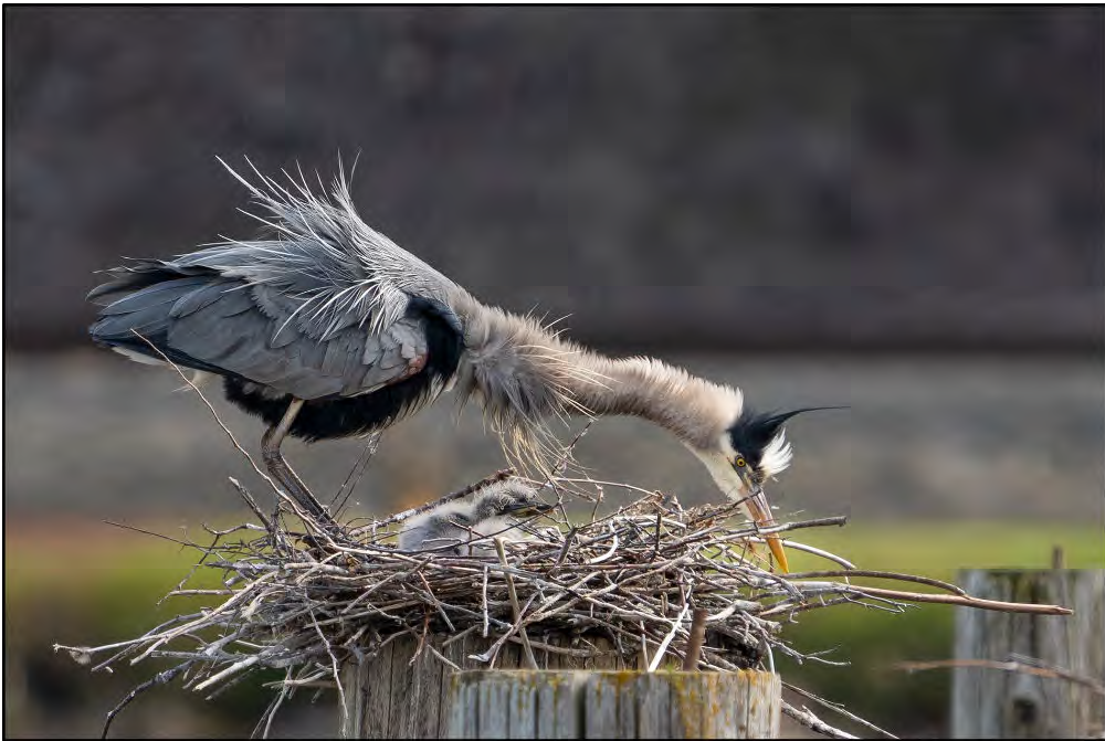
Lynne Greenup Ruffed Feather Day