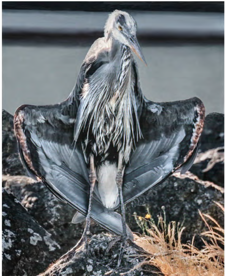
Jack Broom (clockwise from upper left) Hummingbird Visit Flasher on the Waterfront Eagle Spies Lunch Crow Gets Lunch