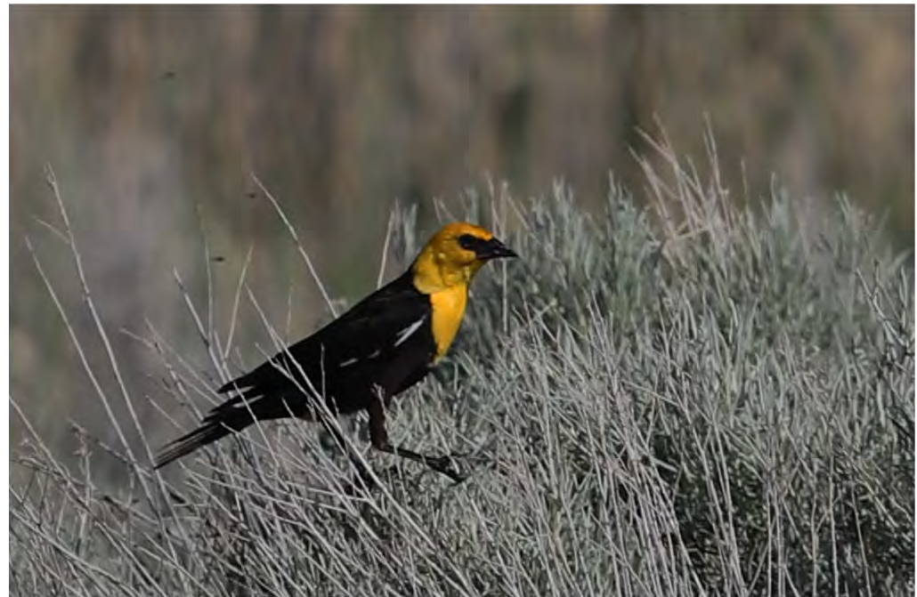
Jake Jacobson Yellow Headed Blackbird