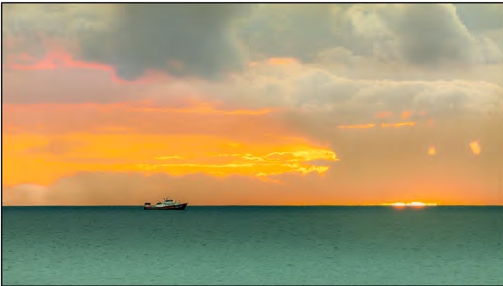
Les Rawlings Few Moments Before Sunset