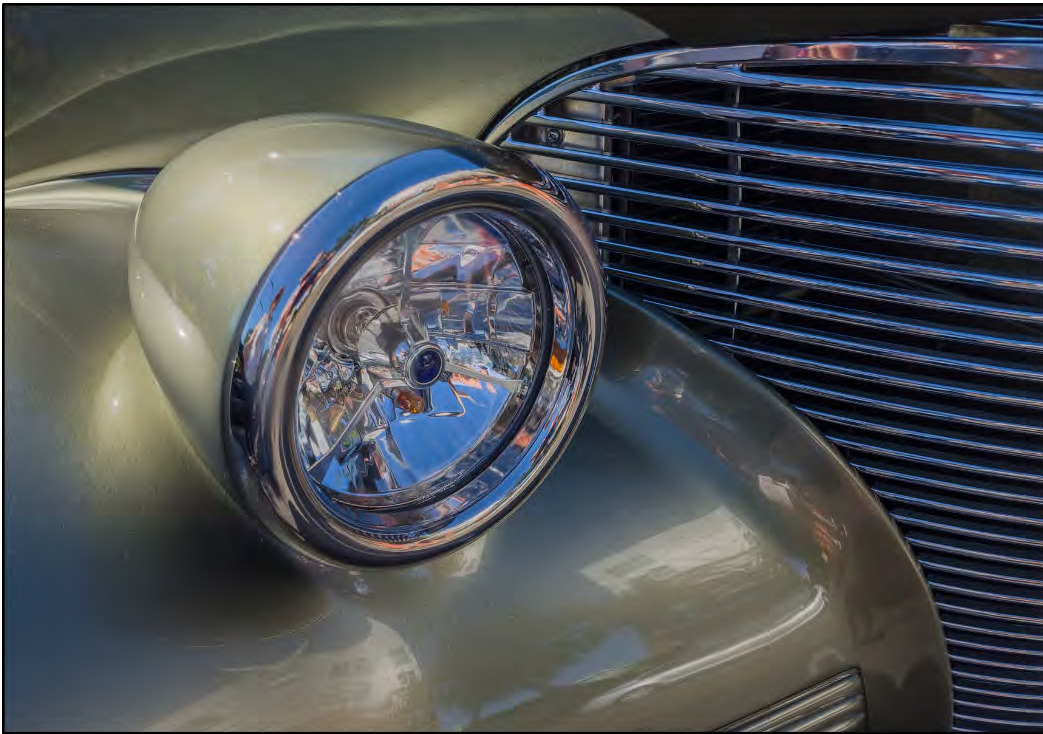
Bill Ray Elegance