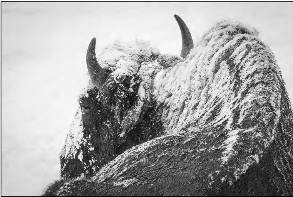
Lynne Greenup Resting But Watchful