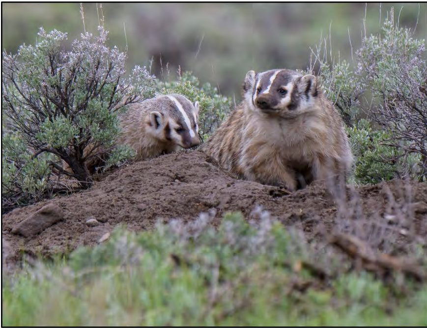
Jeff Lane (clockwise from upper left) Badger Mom and Cub Yellowstone Lake Reflected Noncompliant Cub Bison and Red Dog