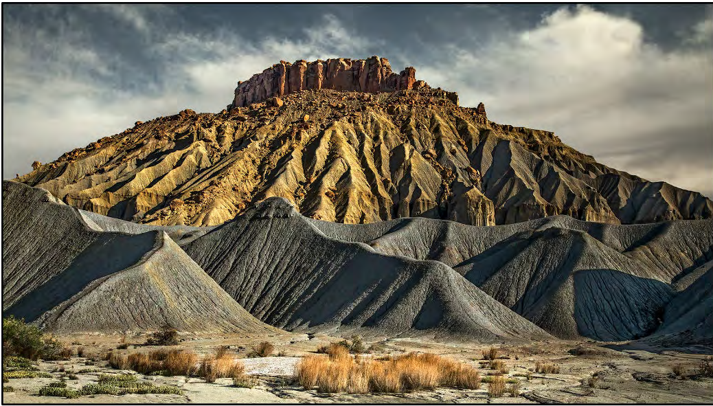
Les Rawlings Caineville Badlands