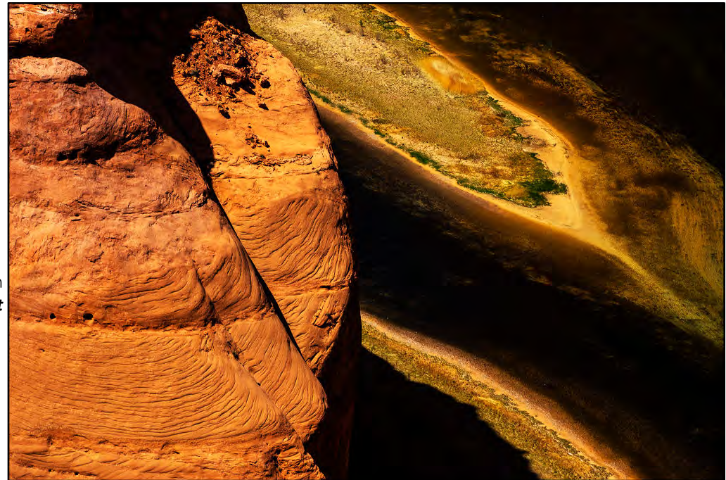
Bob Birnbaum Colorado River Abstract