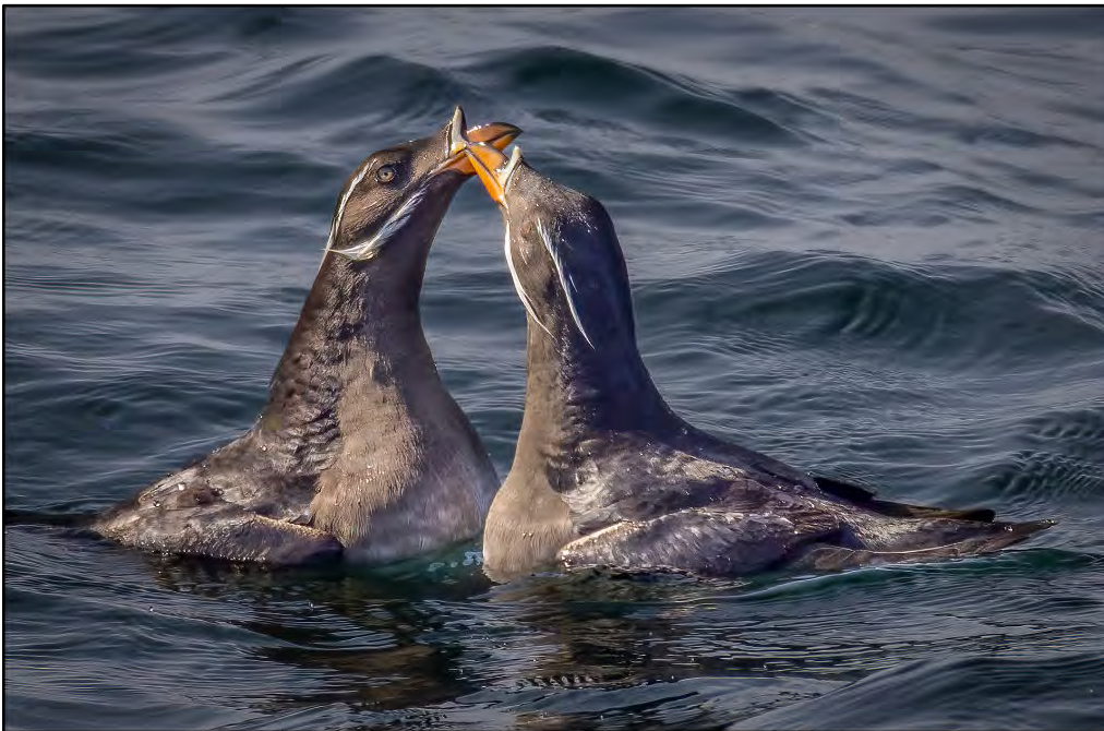
Holly Hauser Rhinoceros Auklets in Spring