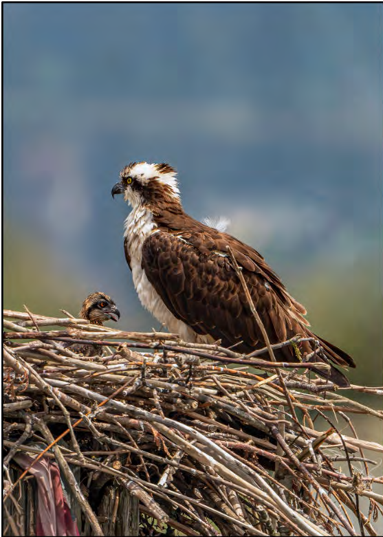
Bruce Ulness Osprey with Chick