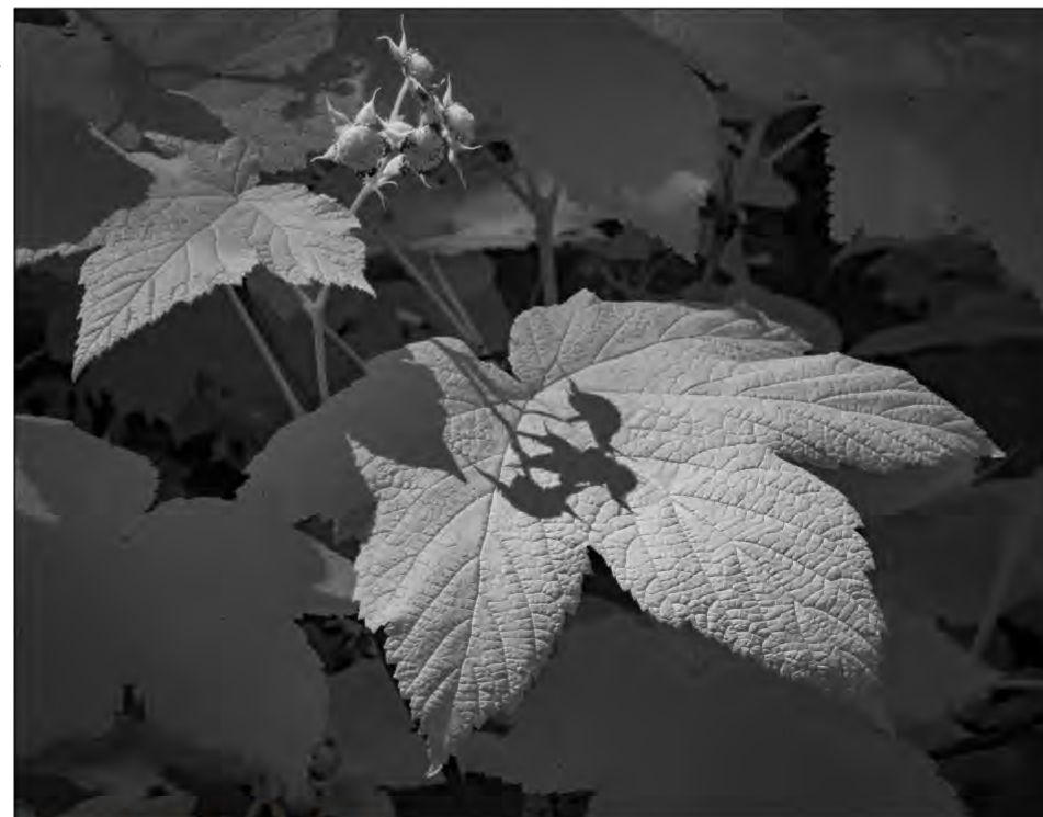
Henry Heerschap Light & Shadow