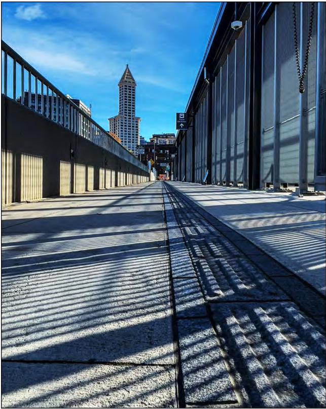
Smith Tower from the Ferry Terminal