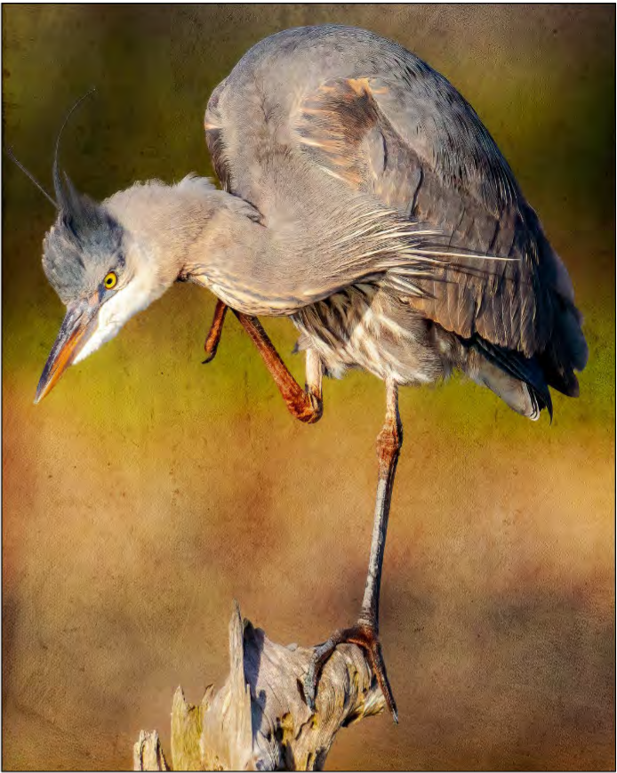
Glen Moffitt Great Blue Heron at Sunset