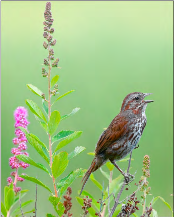
Glen Moffitt Lady Red-winged Blackbird