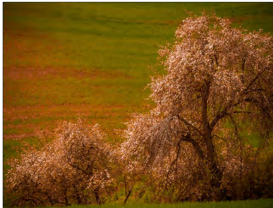
Palouse Summer Sunrise