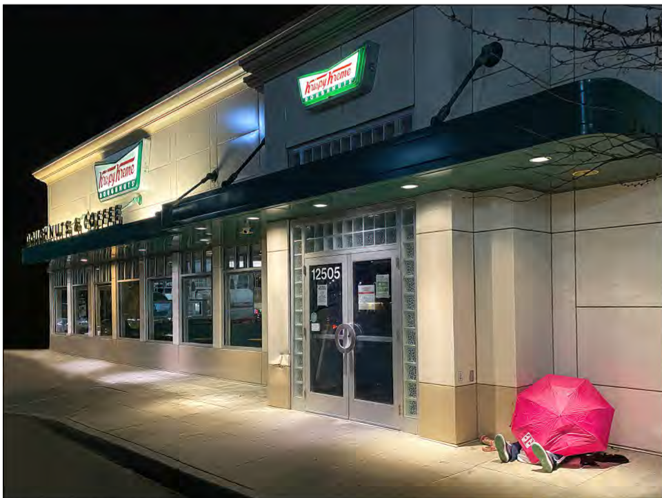
InFocus, the Newsletter of the Puget Sound Camera Club July 2022 Page 5