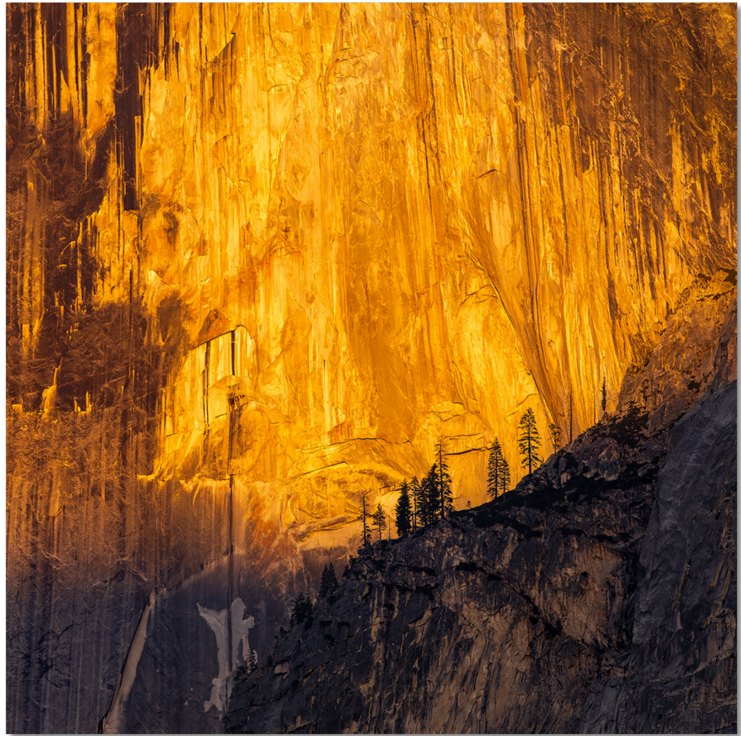
Les Rawlings Sunset on Half Dome Honorable Mention Open Digital Salon