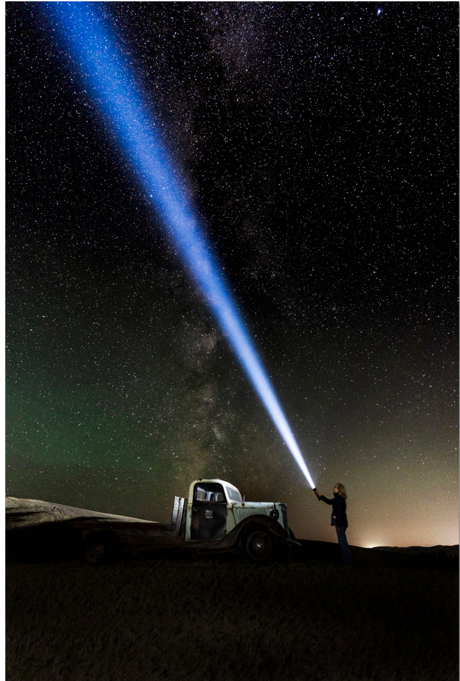
Lynne Greenup Light Beam to the Heavens 2 nd Place, Large Color Open Print Salon