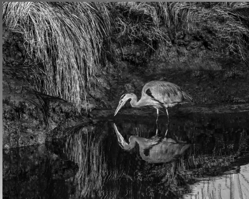
Right: Heron in Marsh 1 st Place, Small Prints Open Print Salon