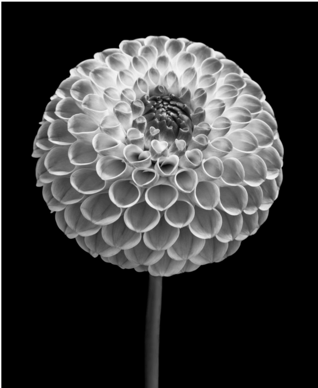
Lower Left: Dahlia Portrait Honorable Mention, Large Monochrome Prints Open Print Salon