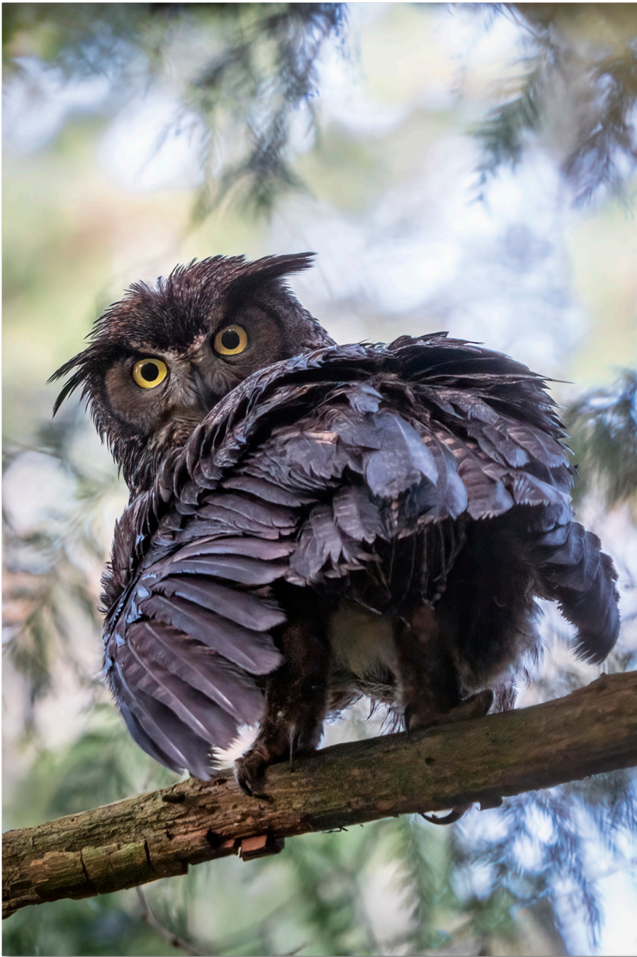
Lynne Greenup Curious Scrutiny Honorable Mention, Large Color Open Print Salon