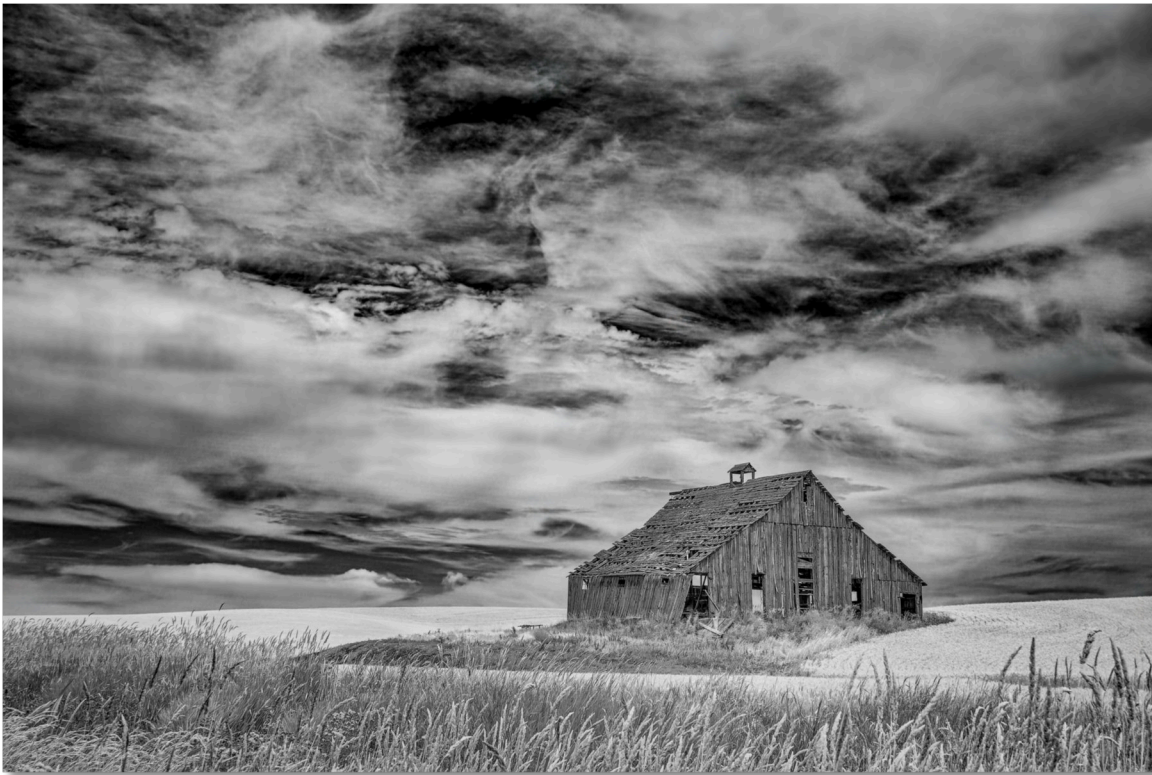
Henry Heerschap Upper Left: Ladow Butte Barn 1 st Place, Large Monochrome Prints Open Print Salon