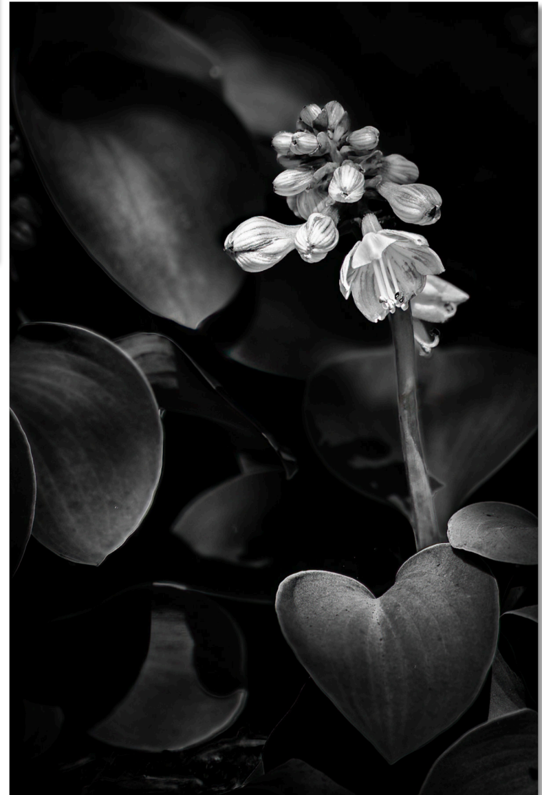
Right: Hosta Blue Mouse Ears Honorable Mention, Small Prints Open Print Salon