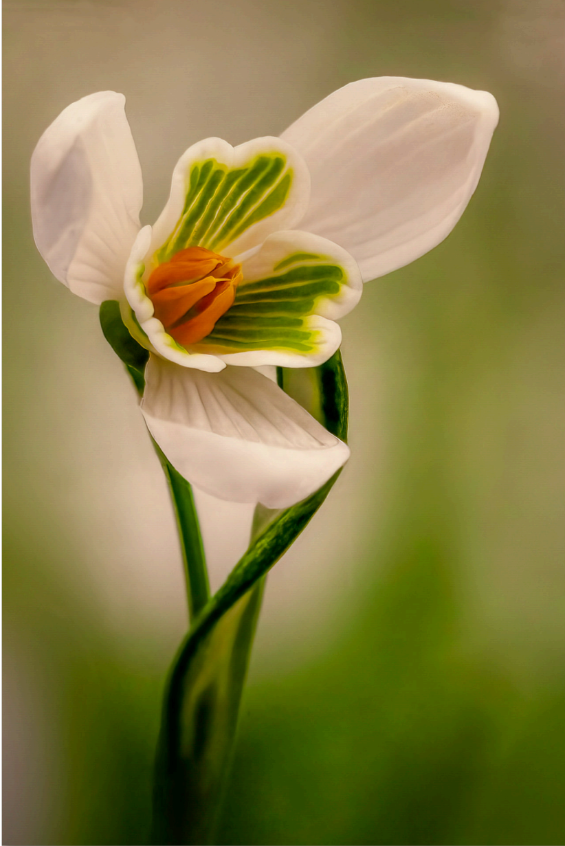
Jack Broom Snowdrop Honorable Mention Open Digital Salon