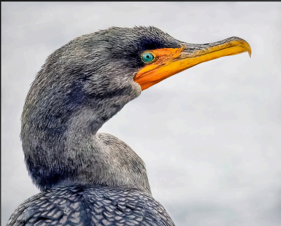
Jack Broom Above: Cormorant Portrait 2 nd Place, Small Prints

This issue features images that placed in the 2023 NWCCC Competitions