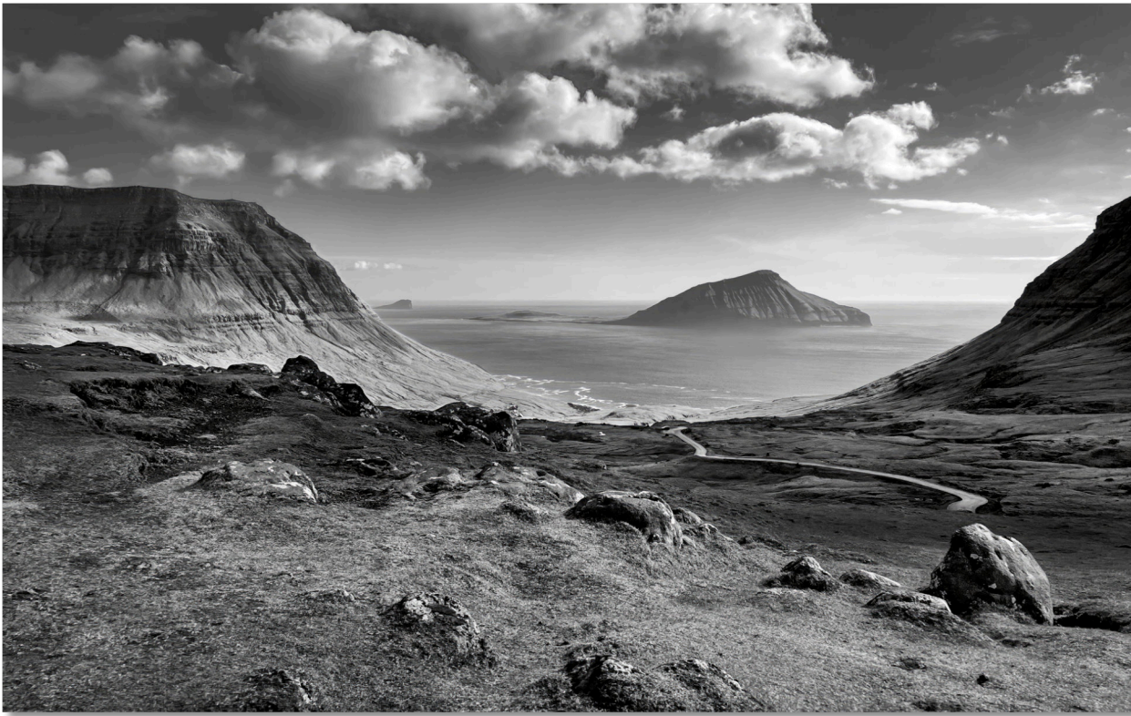
Michael Hrankowski Above: A Distant Land Best of Landscape Open Digital Salon