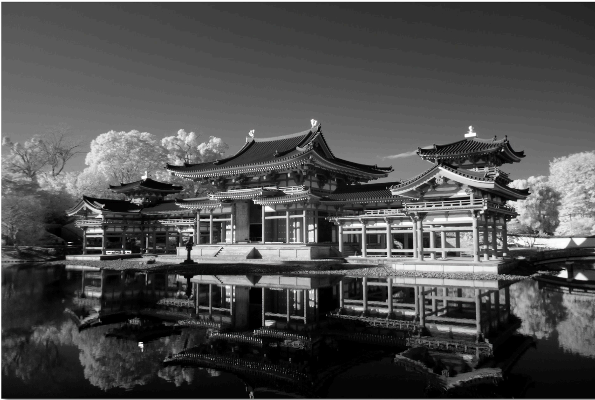
Bob Birnbaum Byodoin Temple Honorable Mention Open Digital Salon