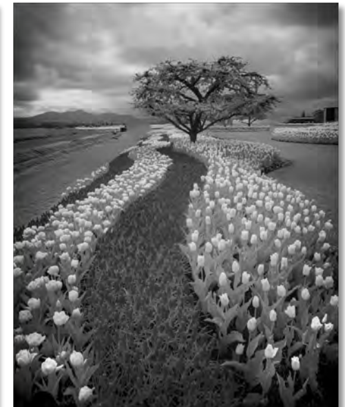
Creativity Award Lauren Heerschap Roozengaarde River