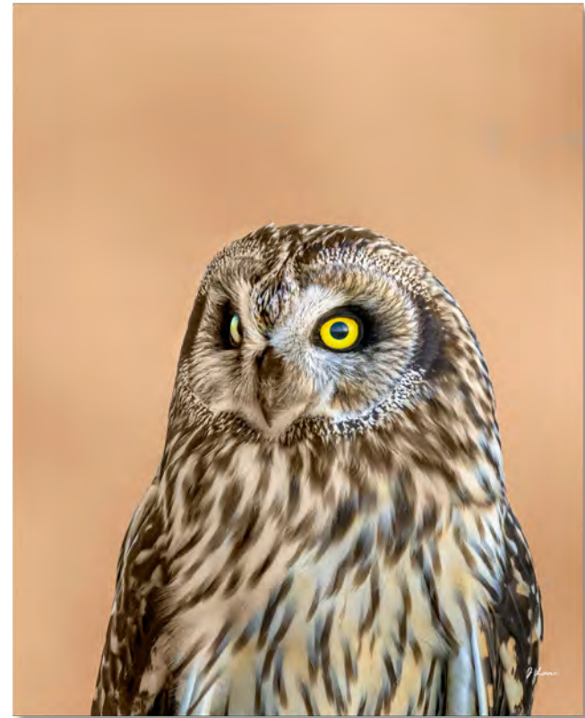
Jeff Lane Short Eared Owl Portrait with Owl Eye View