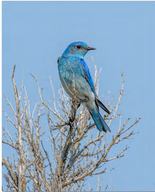
Bill Ray Mountain Bluebird Umptanum Road