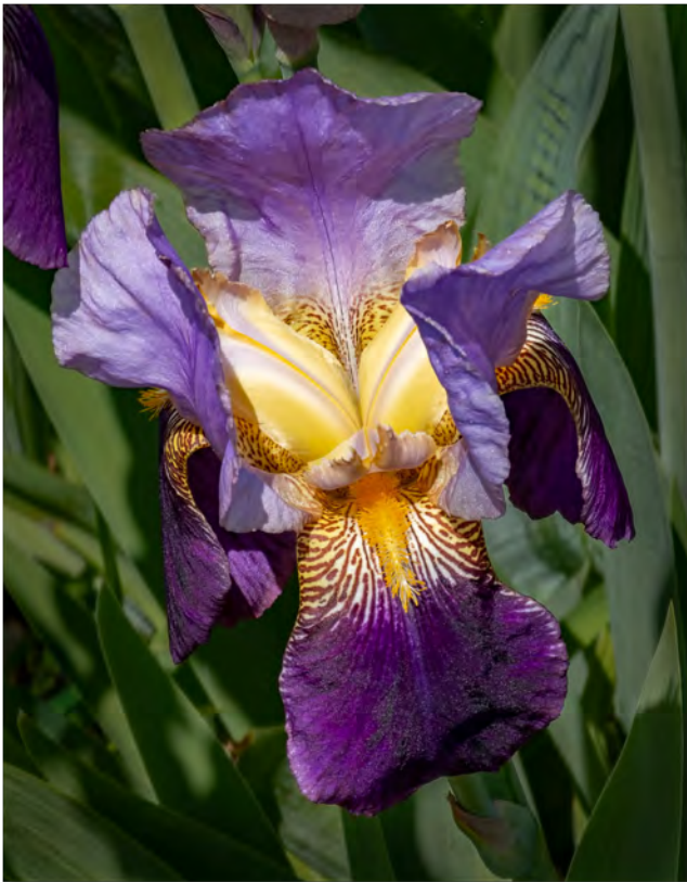
Bill Ray Bearded Iris