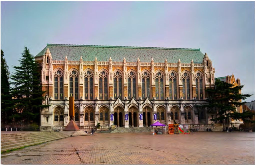
Bob Birnbaum Red Square at Noon on a Schoolday