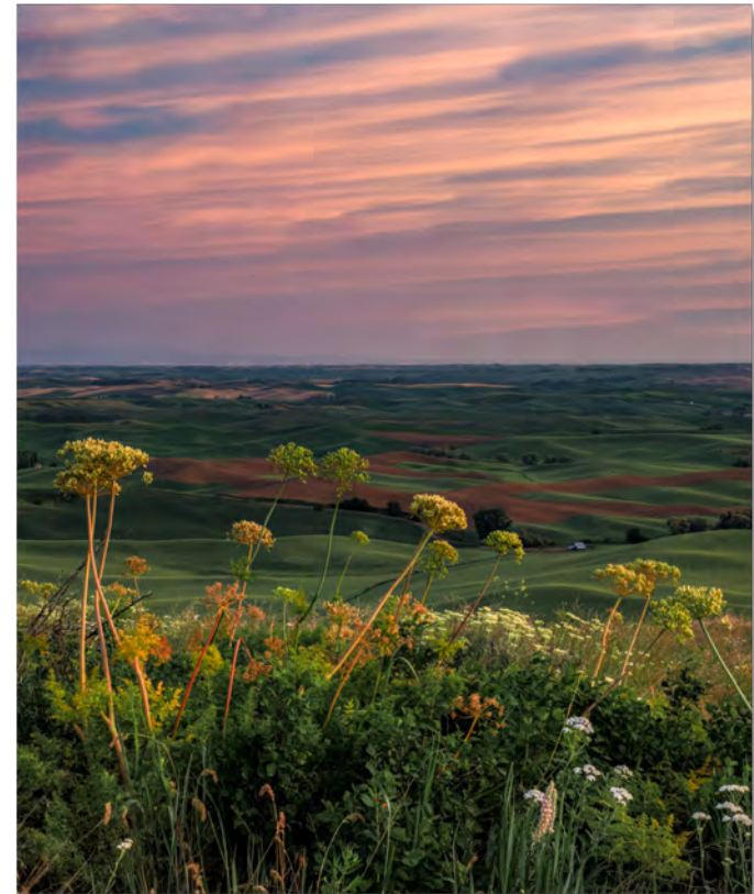
Lauren Heerschap Palouse Wildflowers and Sunset