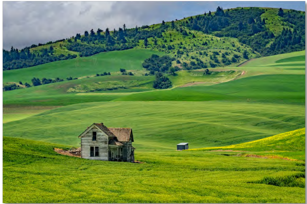
Henry Heerschap The Old Homestead