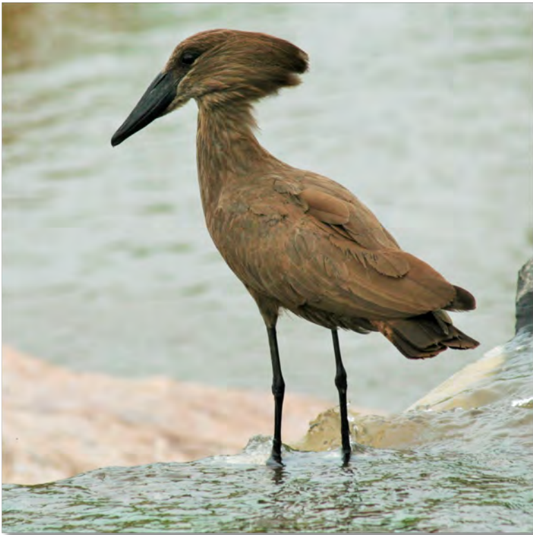
Klaus Lorenz Hamerkop S Africa